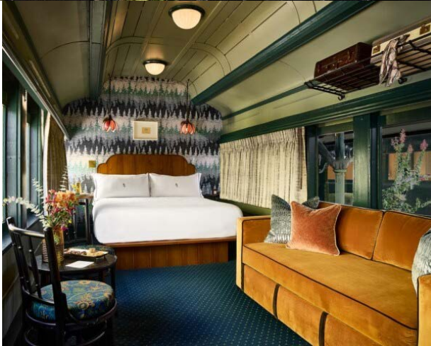
Restored Passenger Car Hotel Room