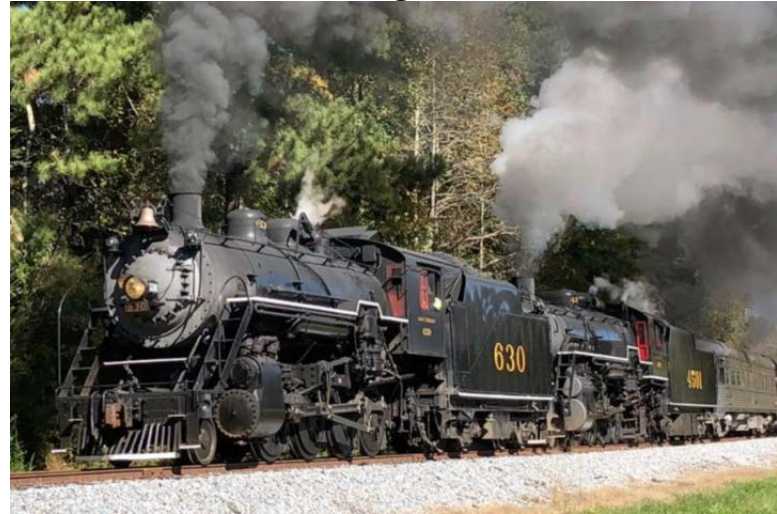
Tennessee Valley Railroad Museum

https://www.tvrail.com/train-rides/summerville-steam-special/