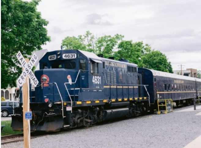
Blue Ridge Scenic Railway