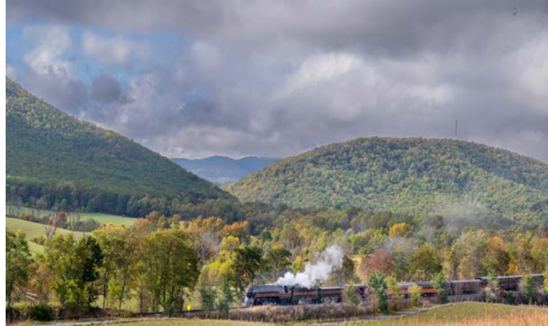
Virginia Scenic Railway