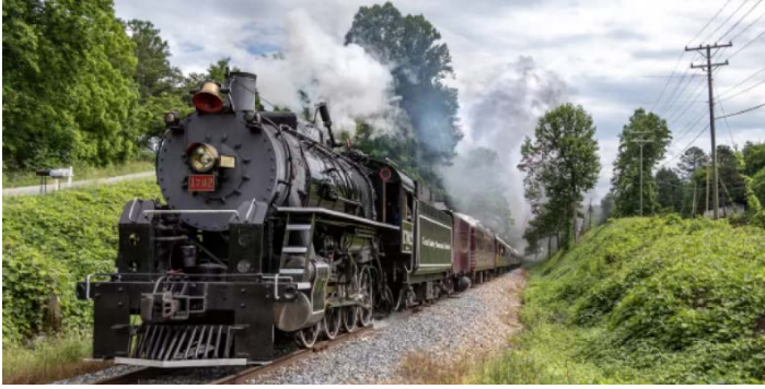
Great Smoky Mountains Railroad